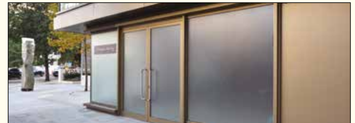
Map is not to scale, lifestyle photography and photography of commercial units at 375 Kensington High Street are indicative only.