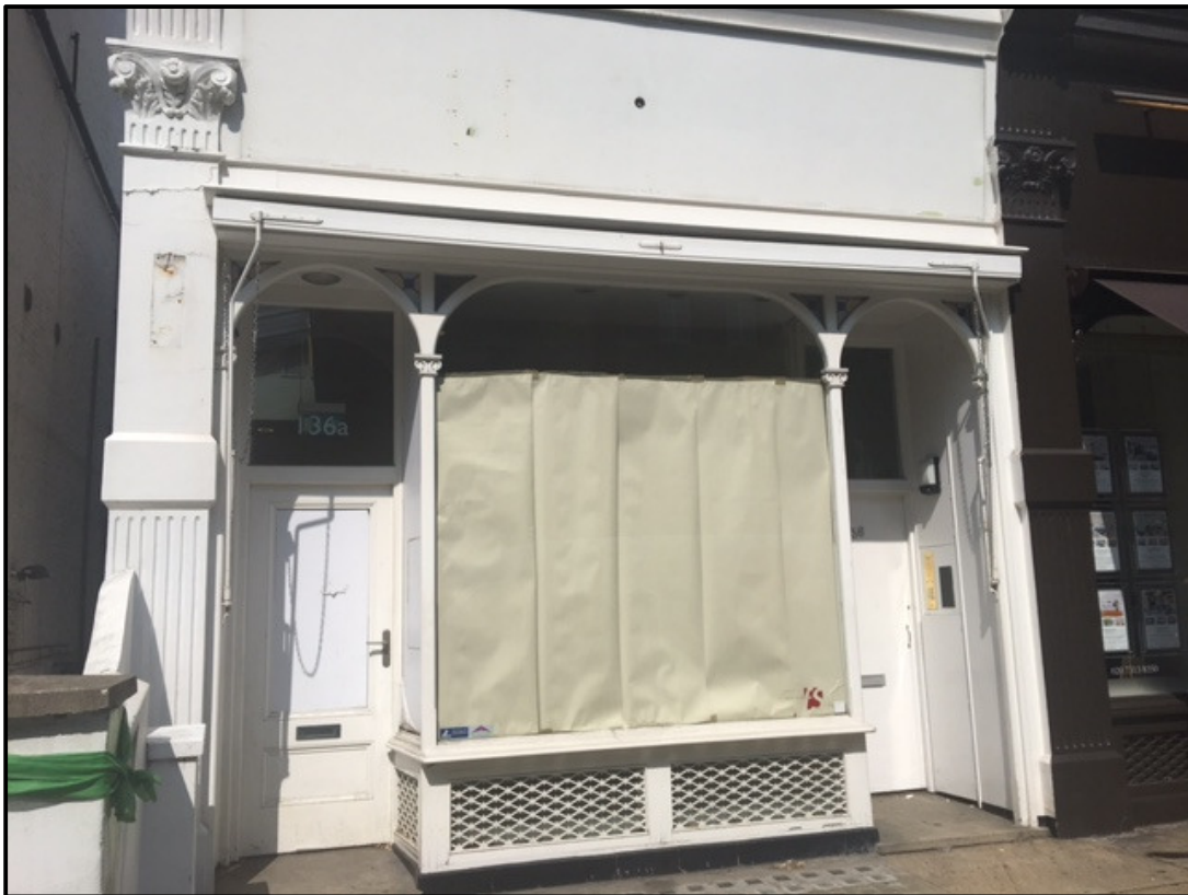
Ground floor and basement, 136a Lancaster Road W11 1QU

Ground floor 760 sq ft 70.6 sq m Basement 477 sq ft 44.3 sq m